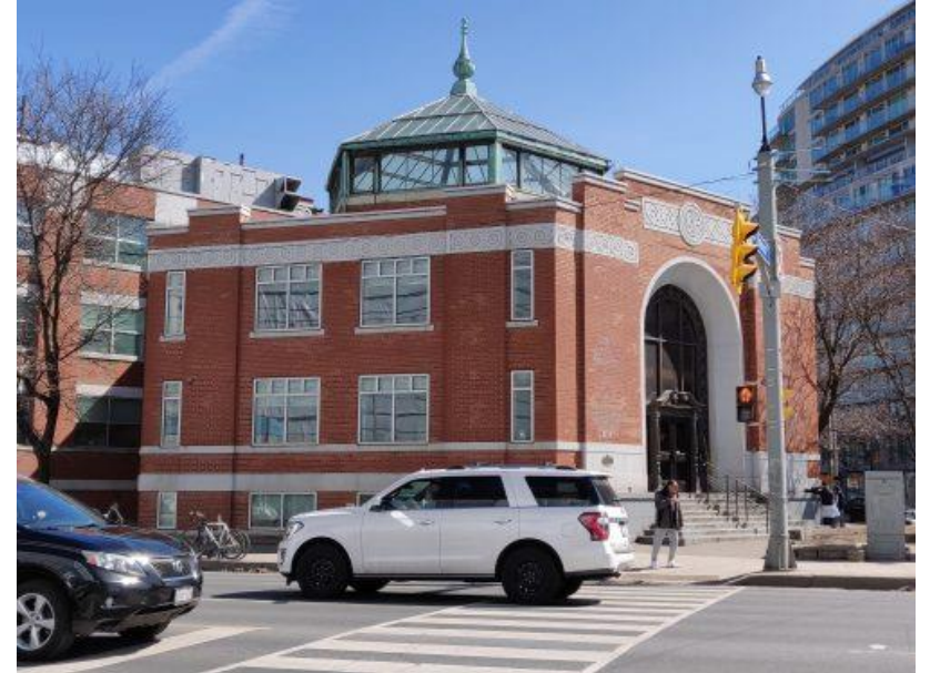
Exterior of the temporary shelter at 545 Lakeshore Boulevard West